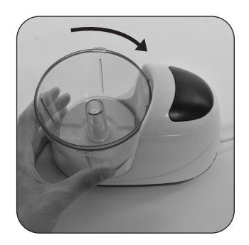
1. Place Part D onto the base on Part E, ensuring that it slots securely into place. Once secure, twist Part D clockwise to lock it into place.