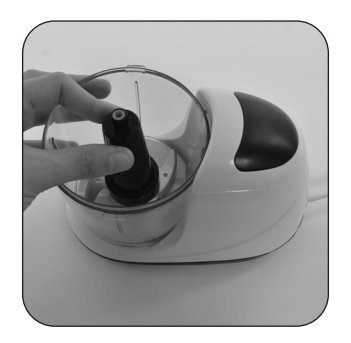
2. Place Part C onto the spindle protruding from the centre of Part D. This will slot into place securely. Proceed to fill the bowl with any food or liquid that is required.