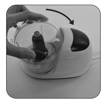
3. Take Part B and fit it securely onto the top of Part D. Twist Part B clockwise to lock it into place. You will hear a click to indicate that it has successfully locked into place. Then plug Part F into the mains wall socket