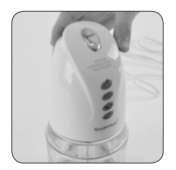
4 PLACE the motor unit onto the lid, ENSURING that it is stable.