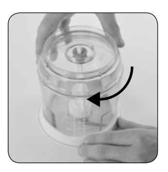
3 INSERT any ingredients and reattach the lid, ENSURING that the guided slots are aligned before TURNING the lid CLOCKWISE to lock it into place.