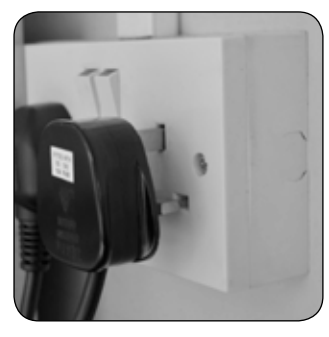
5 PLUG the mains cord into a suitable 220-240v~50Hz mains power supply.

Note: Slide the milkshake attachment onto the spindle of the blades for blending milkshakes.