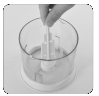
2 PLACE the spindle of the chopping blade onto the support at the bottom of the mixing bowl, ensuring the blades are facing downwards.