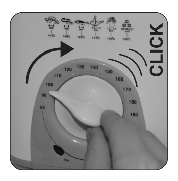
TURN the unit ON by turning the thermostatic temperature control CLOCKWISE past the 'on' mark until it clicks.