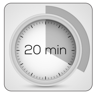
5 ALLOW approximately 20 minutes for the oil to heat up to the set temperature. The heat indicator will SWITCH OFF to inform the user that the deep fryer is READY for cooking.