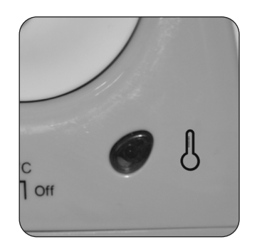
The heat indicator will TURN ON to indicate that the heating element is OPERATIONAL.