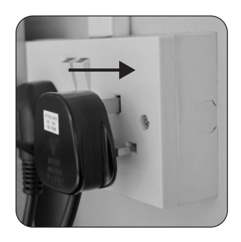
CONNECT the power cord to a suitable 220-240v~50Hz mains supply. IF IN DOUBT, contact a qualified electrician.