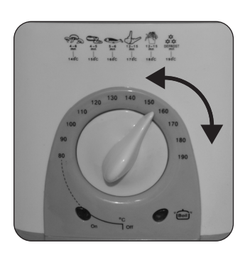
3 SET the temperature to a SUITABLE LEVEL for the type of food that will be cooked.