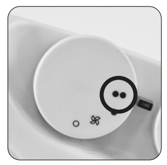
3 OPERATE the unit using the heat setting dial. For the 2000w heat setting, SWITCH the heat setting dial to 'II'.