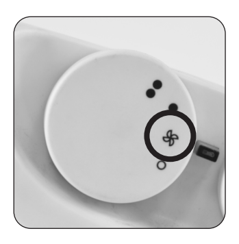
5 To OPERATE the unit as a cooling fan, SWITCH the heat setting dial to the cool blow function.