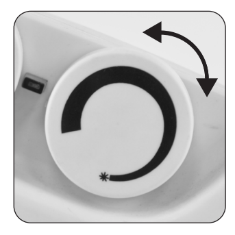
6 USE the thermostat control dial to set the TEMPERATURE LEVEL for the surrounding air temperature. The heater will operate until the surrounding air temperature is at the set level. It will then SWITCH ON and OFF INTERMITTENTLY to keep the surrounding air temperature at a CONSISTENT level.