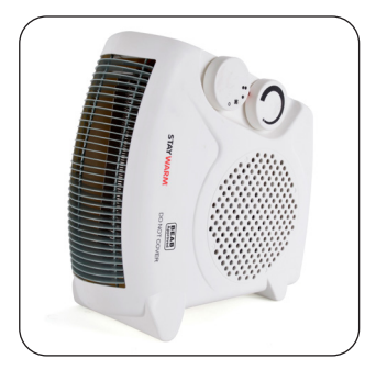
1 UNPACK the unit CAREFULLY, TAKING CARE not to drop the heater. CHECK the unit for transit damage before use. DO NOT use if damaged!