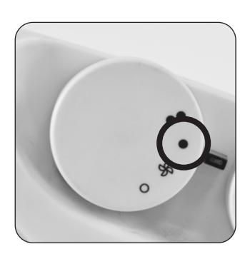
For the 1000w heat setting, SWITCH the heat setting dial to 'l'.