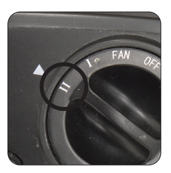
3 OPERATE the unit using the heat setting dial. For the 1500w heat setting, SWITCH the heat setting dial to 'II'.