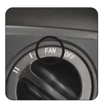
5 To OPERATE the unit as a cooling fan, SWITCH the heat setting dial to the cool blow function.