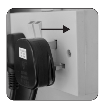
2 CONNECT the mains cord to a suitable 220-240v~50Hz mains supply.