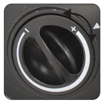
6 USE the thermostat control dial to set the TEMPERATURE LEVEL for the surrounding air temperature. The heater will operate until the surrounding air temperature is at the set level. It will then SWITCH ON and OFF INTERMITTENTLY to keep the surrounding air temperature at a CONSISTENT level.