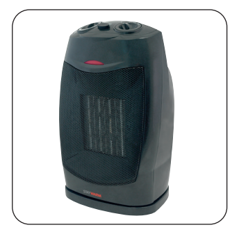
1 UNPACK the unit CAREFULLY, TAKING CARE not to drop the heater. CHECK the unit for transit damage before use. DO NOT use if damaged!