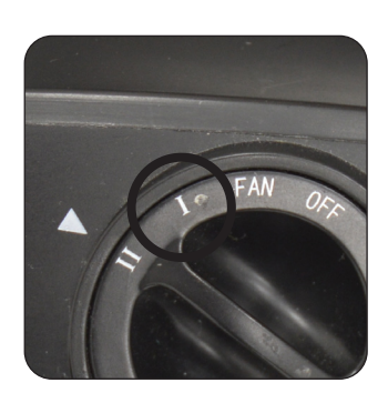
4 For the 750w heat setting, SWITCH the heat setting dial to 'I'.