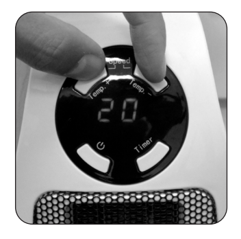
6. Press "Speed" ("Temp. -" and "Temp. +" buttons simultaneously together) is for selecting the fan speed setting in High "HH" and Low "LL" mode.