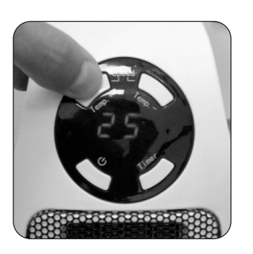
4. Press "Temp. +" button is for increasing the temperature setting in High and Low mode.

Note: The heater must be positioned uprightly (Control panel is at the top). The distance between the heater bottom and the ground should be more than 10cm, the distance between the side of the heater and the wall or any other object should be more than 50cm.