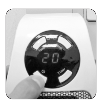
8. When finished, Press " \bigcirc " button, the heater will be off automatically in 1 minute, switch the power switch at the side of the heater to "Off" position and unplug heater from power outlet.

Power-on Timer: When the heater is off, Press "Timer", the digital display shows the "hours" option for the timer. Continue to press the timer button to change the number of hours you would like the heater's internal clock to count down before powering itself on. The hour options for the timer are from 0 to 12 hrs. ( in 1 hr increment).