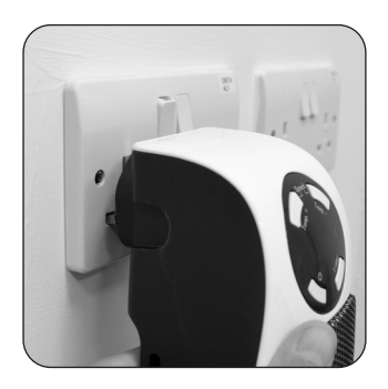
1. Plug the heater into a suitable power outlet, observing all the instruction regarding positioning.

Note: Powering off the heater will stop the heating process only. The fan will continue to blow for approximately 1 minute to allow for the interior components to cool. The fan will then turn off automatically.