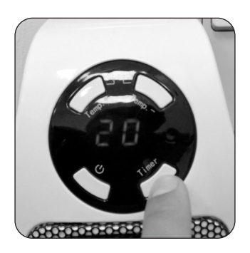
7. Press "Timer" to set timer (0-12 hr).

Power-off Timer: When the heater is on running, Press "Timer", the digital display changes from the "temperature" to the "hours" option for the timer. Continue to press the timer button to change the number of hours you would like the heater to run before powering itself off. The hour options for the timer are from 0 to 12 hrs. (in 1 hr increment).